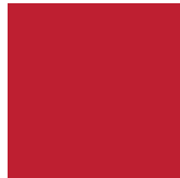
IS06 - Red