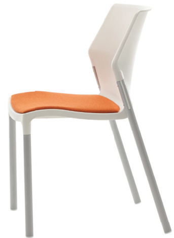
IO33 - White & Messenger MG071 Satsuma