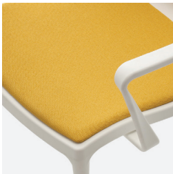
Upholstered seat pad