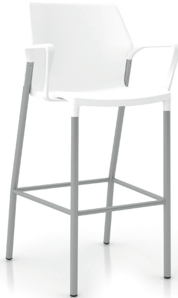
IO32H - White