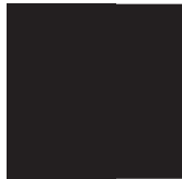
IS03 - Black