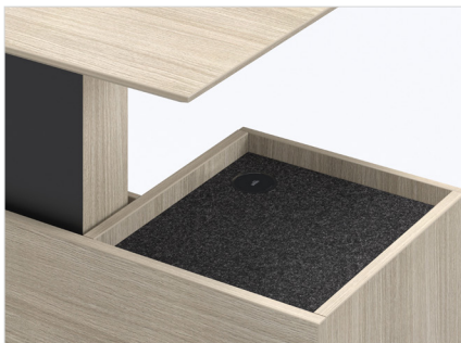
Above: Installation of several wireless chargers on a Nex meeting table.