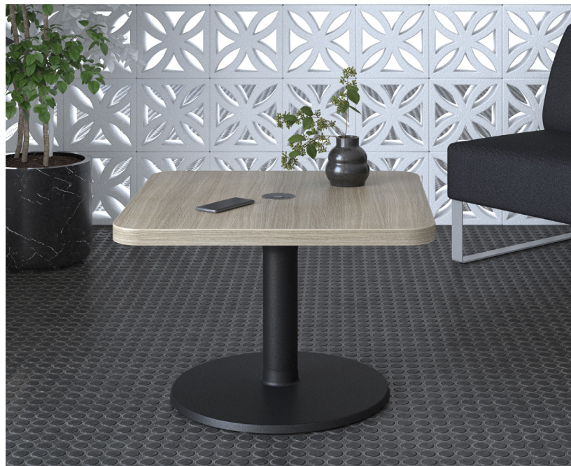
Right: Discreet installation directly on the central post of an occasional QUORUM Multiconference low table.