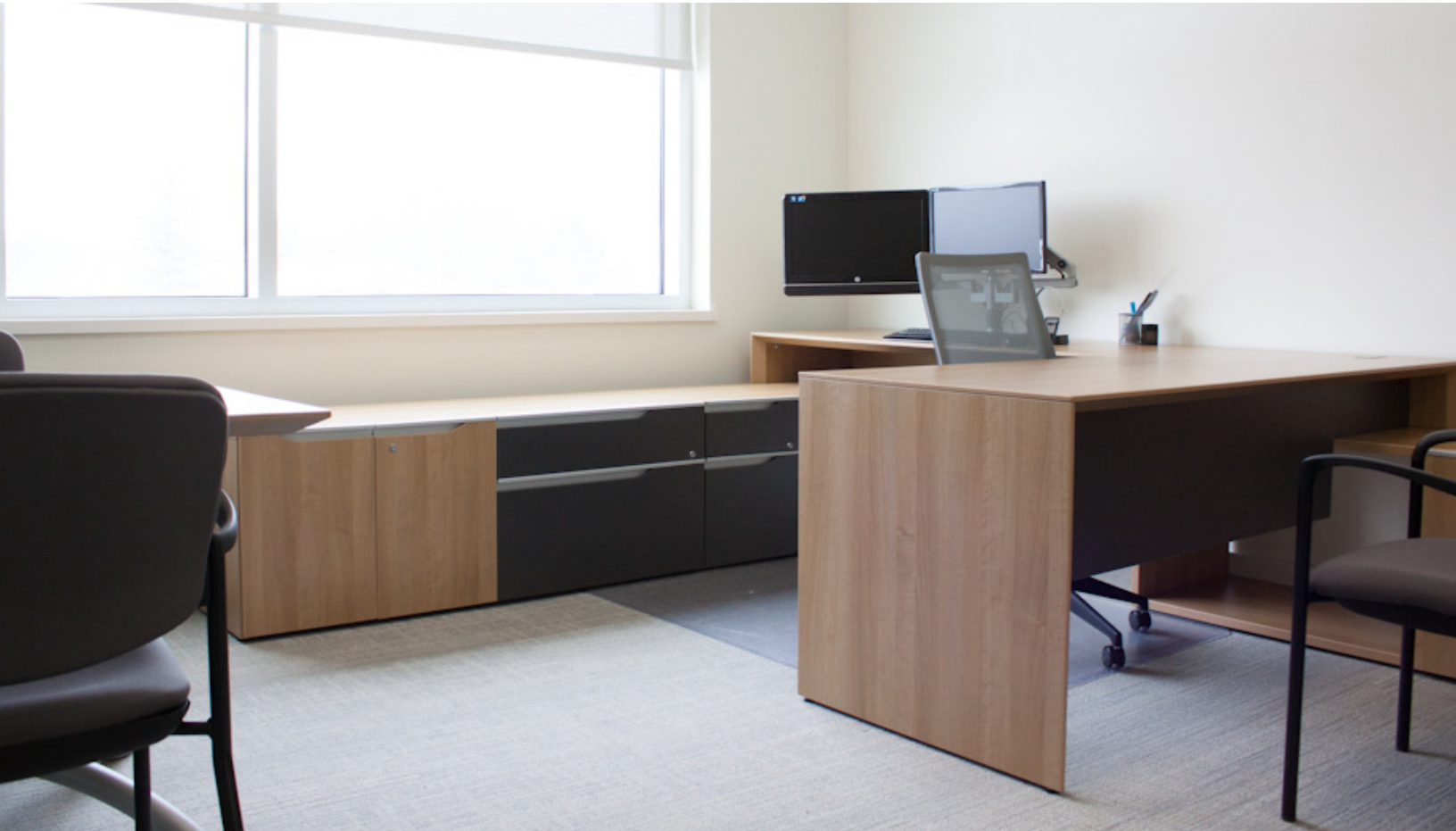
Top: Nex workstation.

Credit for the success of this project goes out to a large team. Therrien Couture Lawyers, Cimaïse, Mobiliers H. Moquin and Groupe Lacasse professionals all worked side-by-side to ensure that the Therrien Couture Lawyers offices would become a benchmark modern working environment. The law firm's new workplace is both esthetically impressive and vibrantly functional!