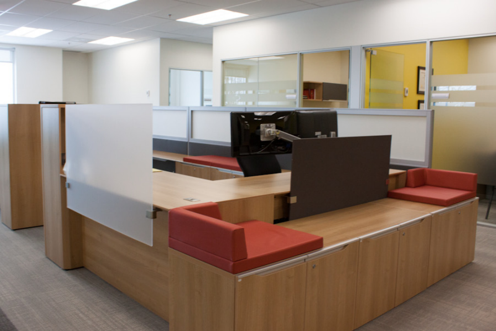
On this page: Nex furniture by Lacasse for the assistants' workstations.