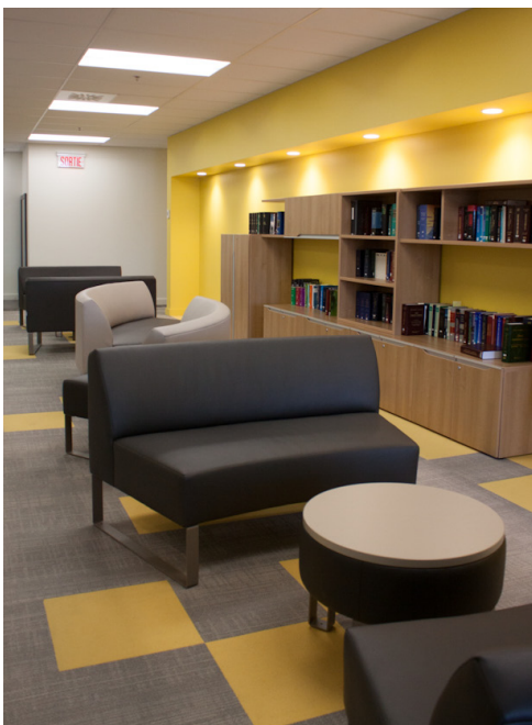
Top: Nex furniture and Nvision System for the assistant workstations. Below: Nex storage modules and Hip Hop modular soft seating for the meeting and lounge areas.