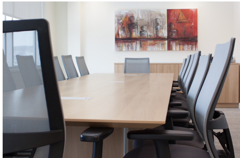
Right: Quorum Multiconference table with Affinity seating by United Chair for the conference rooms.