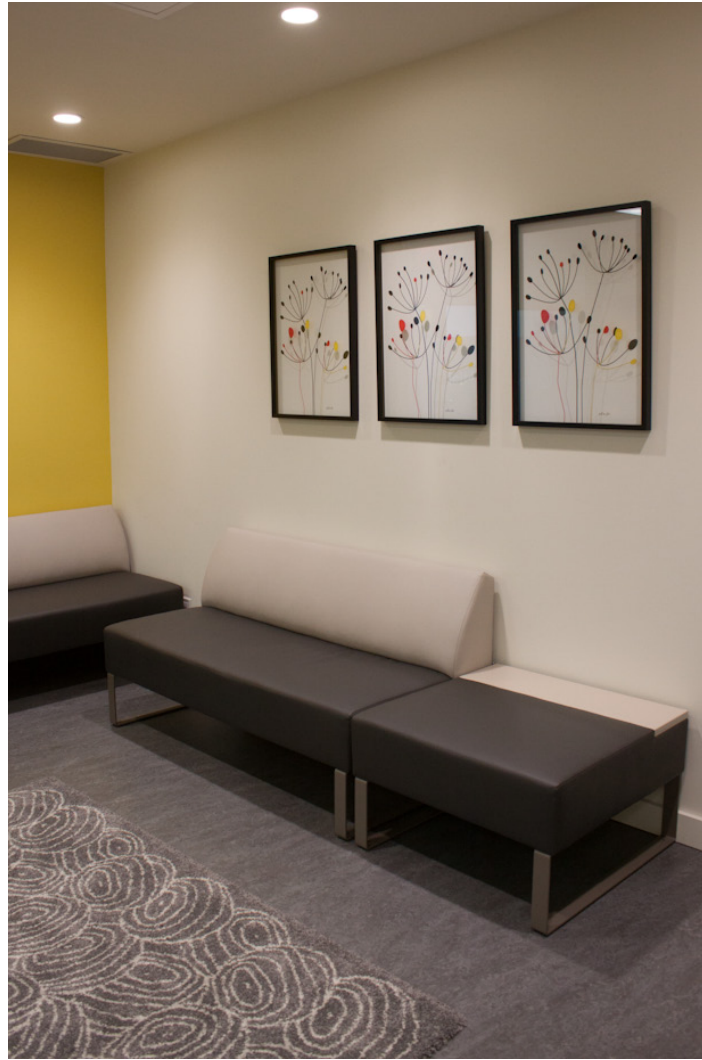
Top: Lacasse steel lateral files. Right: Hip Hop modular soft seating.